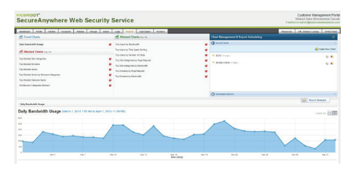
Interactive drill-down reporting

The Webroot® Desktop Web Proxy (DWP) agent enforces seamless authentication, and is automatically updated to the latest version, minimizing any operational administration.